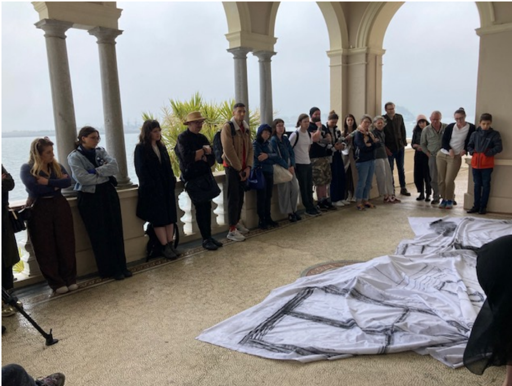
Cork Caucus' legacies.