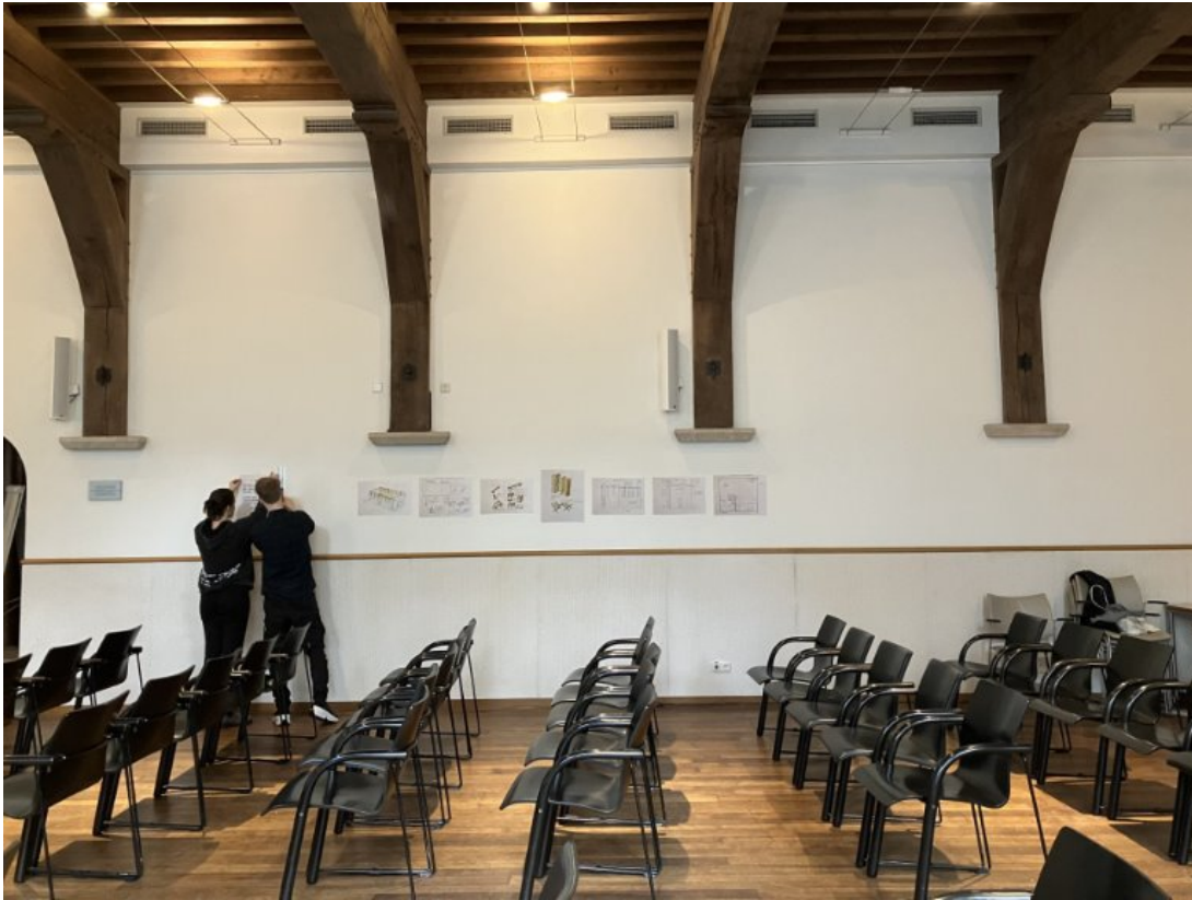
[During installation, 29 October 2024]