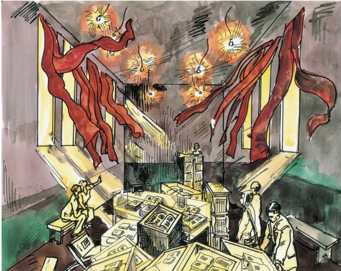
[Ilya and Emilia Kabakov, The Old Reading Room, 1999]